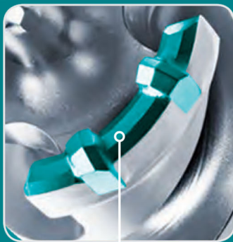
AGGRESSIVE OUTER CUTTING RING with deep inserted carbide teeth for longer life

60% LONGER LIFE (Compared to previous core cutter)