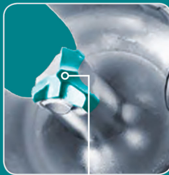
LARGE 20MM TRI-CUTTER CENTERING DRILL BIT