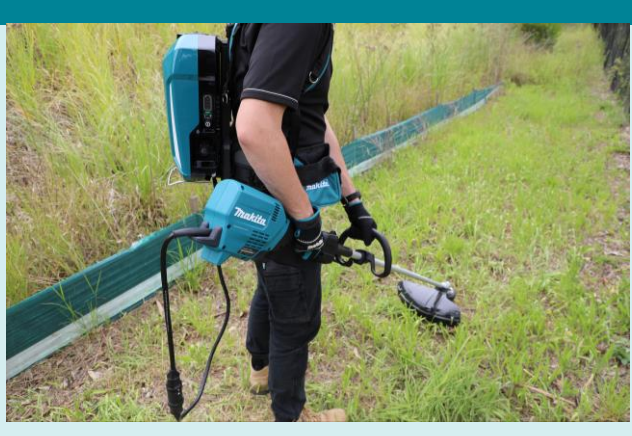
Provides up to 1,206Wh