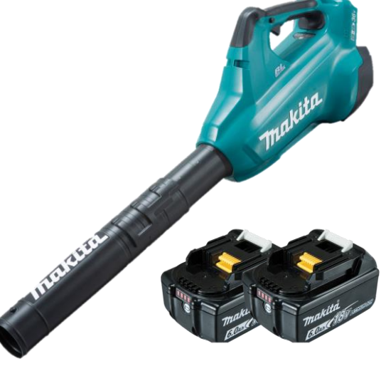
5.6 times more runtime