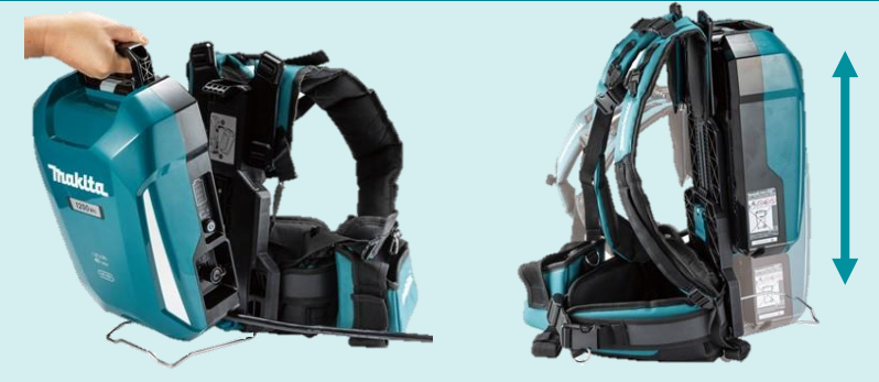
Adjustable backpack harness provides maximum comfort for all users