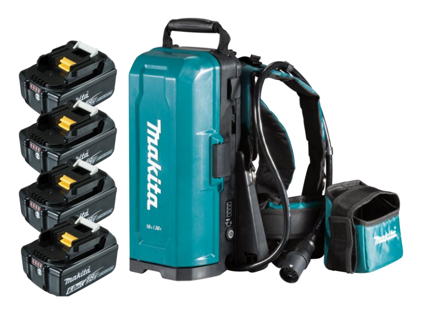
2.8 times more runtime