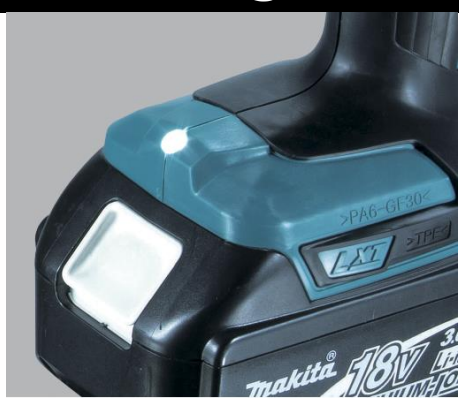
Single LED job light with afterglow function