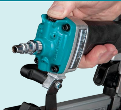
Air duster to blow away dust and debris