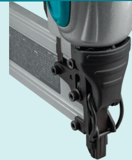
Slim nose tip for precise nailing