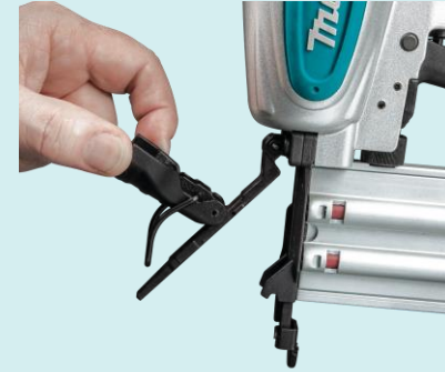
Tool-less clearing of jammed nails